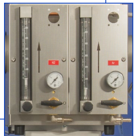
gas supply system