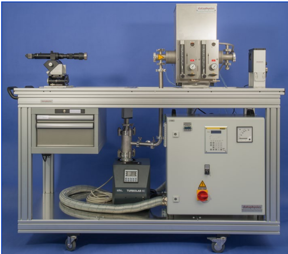
OCA 25-HTV 1800 with optional trolley cart

Video-based contact angle measuring and contour analysis system for high temperatures and vacuum